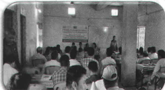
Financial Management PRI Training, Sonapur