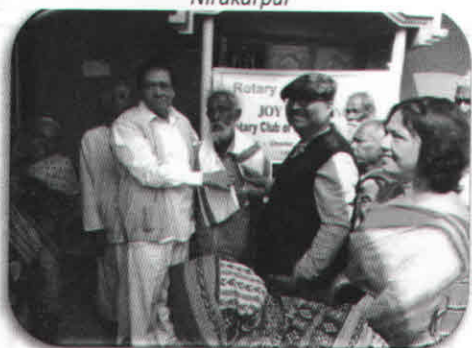
Joy of giving programme at Senior citizen home, Khordha