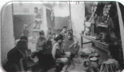
Festival Celebration at Swadhar Greh, Kalingavihar, BBSR