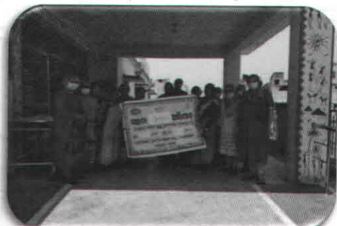
Swachhata campaign by UPHC, Utarmukhi, Berhampur