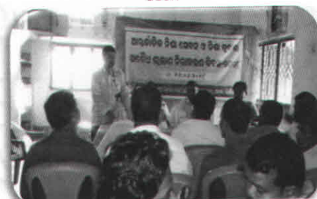
Celebration of International Day on Drug Abuse and illicit trafficking IRCA, Manmunda