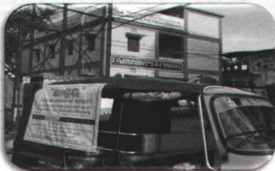
Miking Awareness on Berhampur SUH