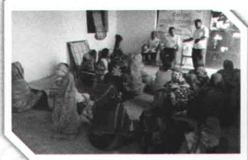
Awareness programme on DV Act. FCC programme