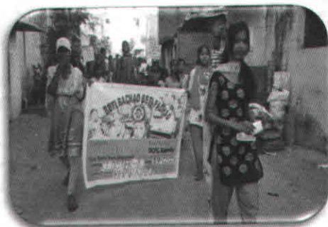
Beti Bacho Beti Padhao Padajatra OPHS, BBSR