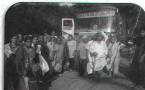
Outing Programme of Senior citizen home Nirakarpur