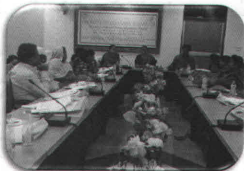
Financial Training of PRI members, Khordha