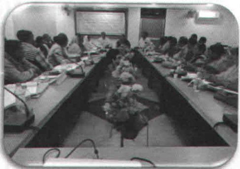
Financial Management Training for EO's & Sarpanches, Khordha District at DRDA, Khordha