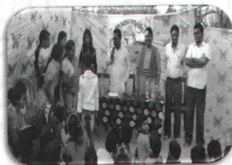
Beti Bachao Beti Padhao Programme, Ghatikia, BBSR