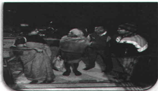
Rescue of helpless under Baripada SUH