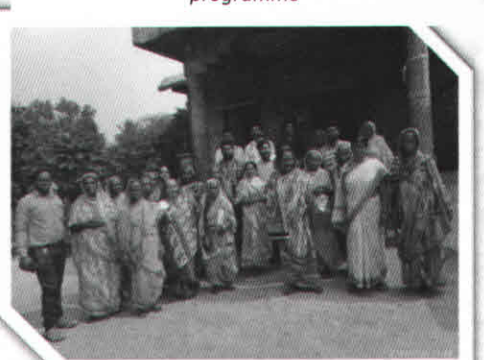
Senior Citizen of elderly Women outing programme