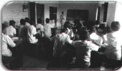
Teaching Class Room RPS Durgaprasad, Khordha