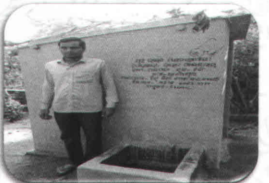
Swachha Bharat Mission House Hold Latrine