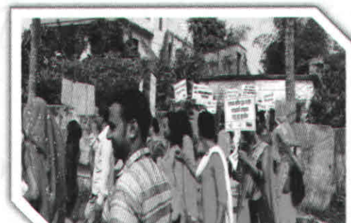
Padajatra on HIV-Aids Prevention Awareness programme, BBSR