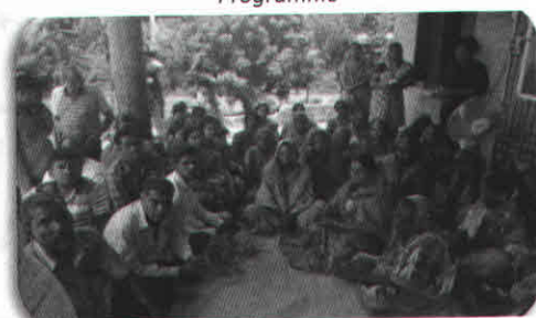
Senior Citizen's Elderly Women Spiritual Discussion, Tangi