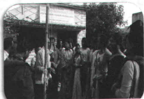
15 th Aug. Celebration MSM Project, BBSR