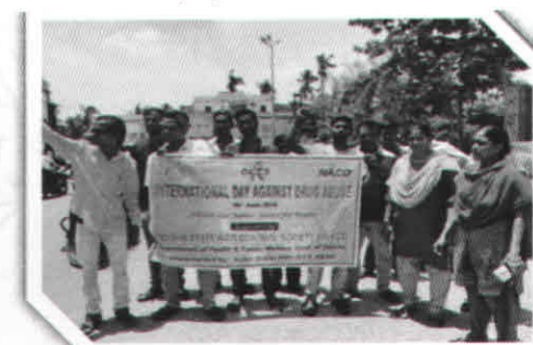
Padajatra on Drug abuse day celebration