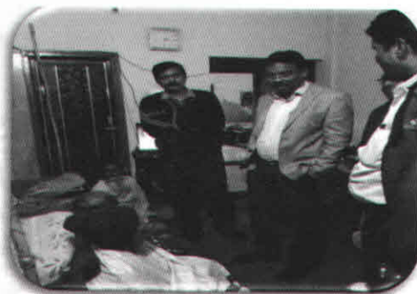
Blanket and Dry food distribution in Senior Citizen Home by District Collector, Khordha