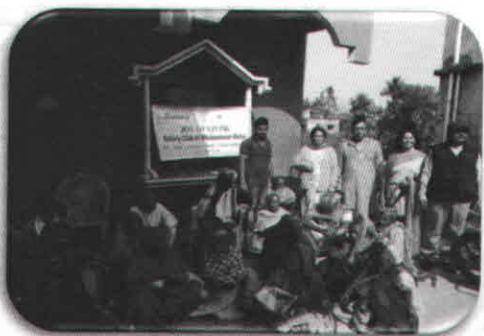
Joy of giving programme at Senior citizen home, Khordha