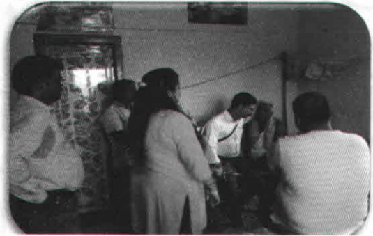
Official from MS & JE Dept. visited Senior Citizen Home, Khordha