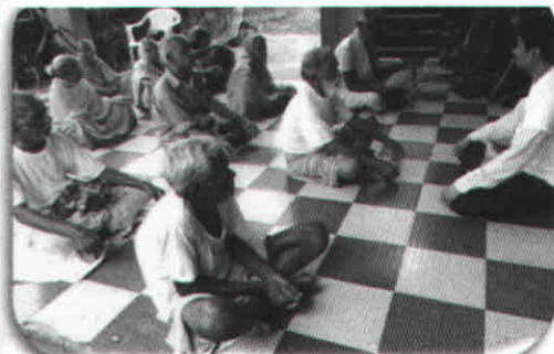
International Yoga day celebration at Senior Citizen, Khordha