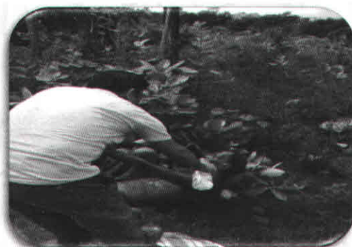
Rescue of ill old man under Boudh SUH