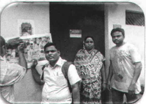
House hold USHA Survey, Jatni ULB