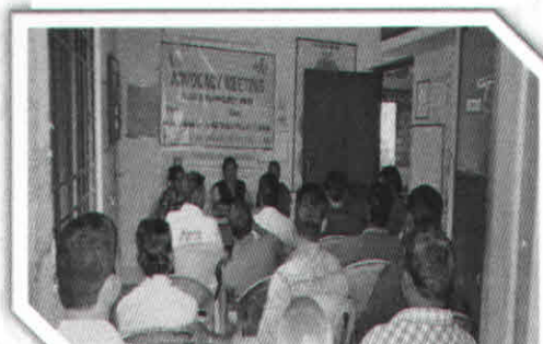
Advocacy Programme IDU Project, BBSR