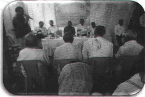
Legal Aid Programme at Senior Citizen Home, Khordha