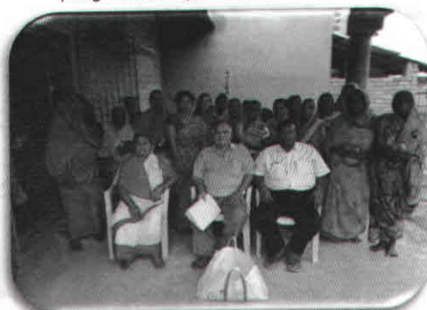
Senior Citizen's Health Awareness Programme