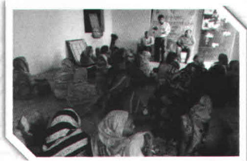
Awareness programme on DV Act. FCC programme