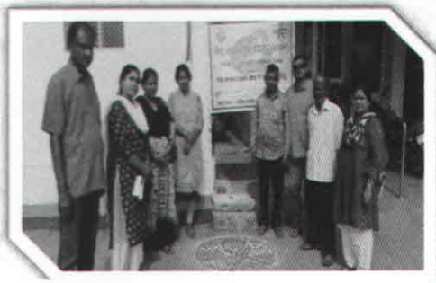
World Aids day celebration TI Project, BBSR