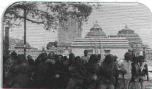
Outing Programme of Senior citizen home Khordha