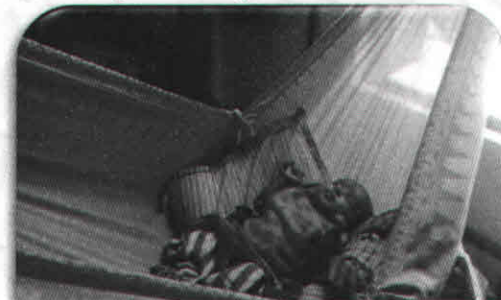
Rescue of children and helpless parent under Berhampur SUH