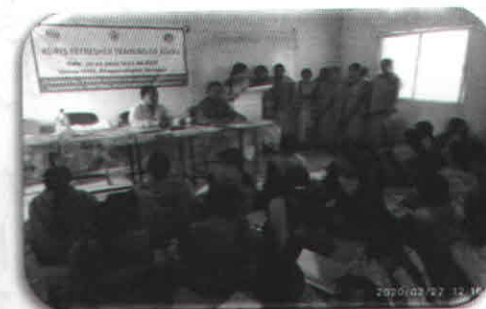
ASHA Training Sonepur