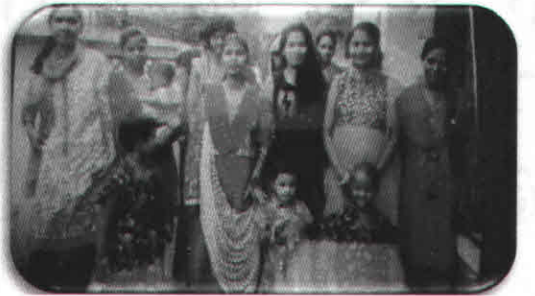
Inmates of Swadhar Greh, Kalingavihar, BBSR