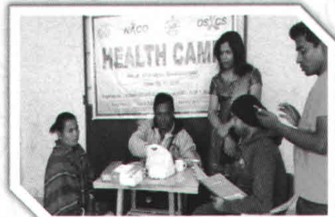
Health Check-up camp MSM (TI), BBSR