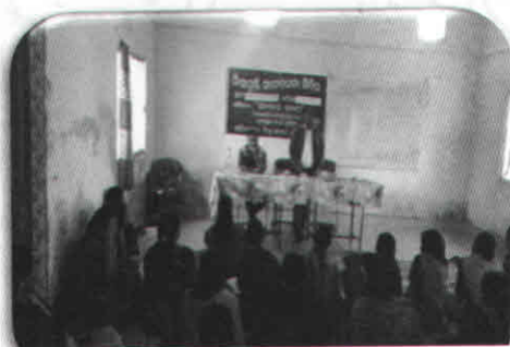
Drug Deaddiction Awareness programme by IRCA, Manamunda