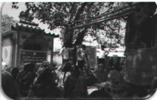
SHG CBT Training on SM & ID of Khordha ULB